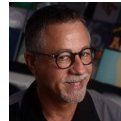
CSPA GOLD KEY RECIPIENT NSPA PIONEER AWARD WINNER DOW JONES NATIONAL JOURNALISM TEACHER OF THE YEAR RECIPIENT