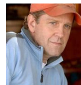
PULITZER PRIZE NOMINATED