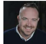
CROWN & PACEMAKER FINALIST JEA RISING STAR & SPECIAL RECOGNITION

FOR MORE INFORMATION AND UPDATES: WWW.FLORIDAYEARBOOKINSTITUTE.COM