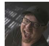
JEA NV STATE DIRECTOR CSPA GOLD MEDALIST PACE MAKER FINALIST