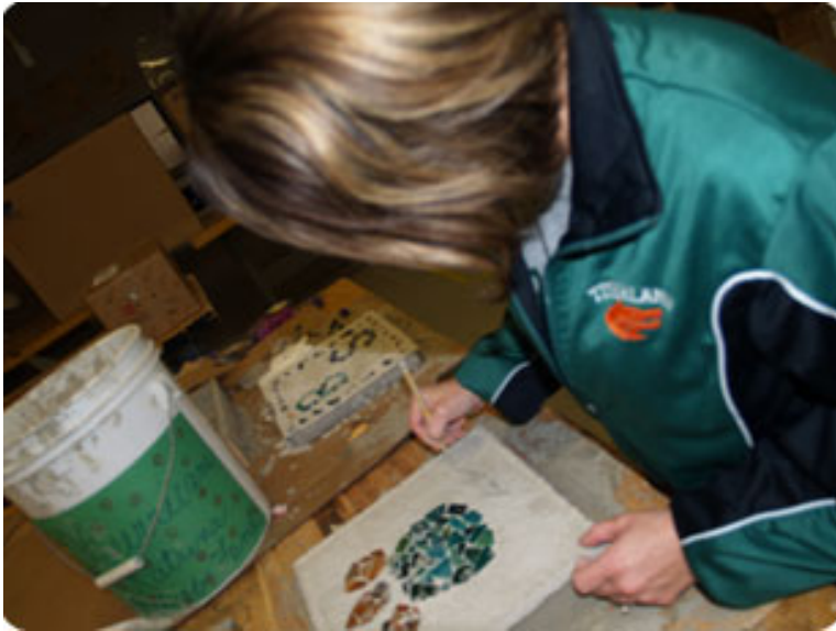
Timberland High School